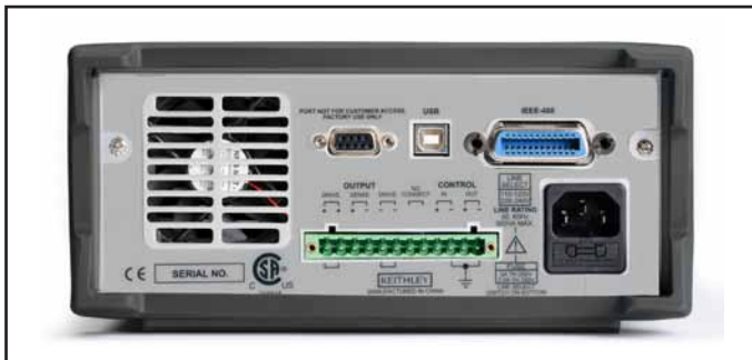
Series 2200 rear panel.

1.888.KEITHLEY (U.S. only) www.keithley.com